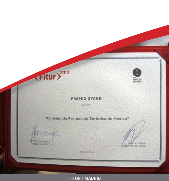
FITUR - MADRID