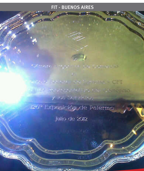
FIT - BUENOS AIRES