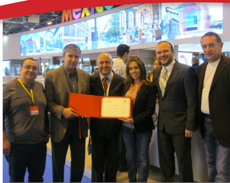
FITUR - MADRID