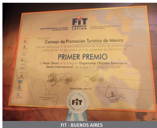
FIT - BUENOS AIRES