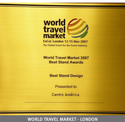
WORLD TRAVEL MARKET - LONDON

STANDHAUS has the honor of having received, for our clients, important prizes and honorable mentions throughout our trajectory for Design and Construction. Here we showcase just a few that we have recently received.